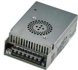
F Type: 6(L) x 4(W) x 2(H) inches.