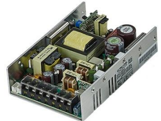
U Type: 6(L) x 4(W) x 1.5(H) inches.