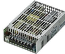
C Type: 6(L) x 4(W) x 1.55(H) inches.