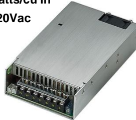
E Type: 7(L) x 4(W) x 1.6(H) inches.